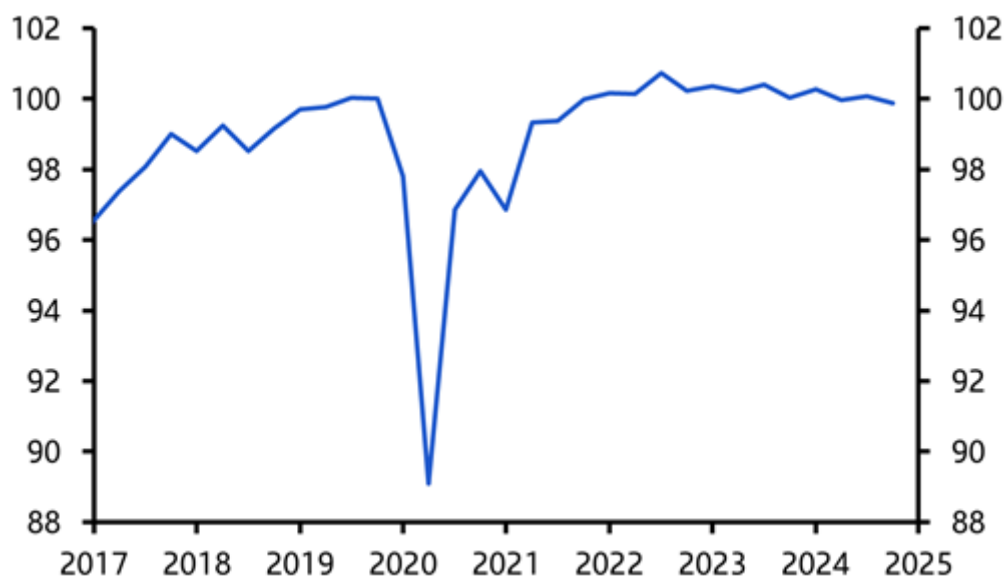
Chart 2: Germany Real GDP (Q4 2019 = 100)